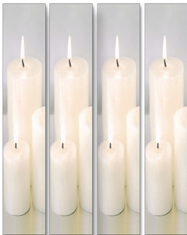
Laminated Bookmarks (4)