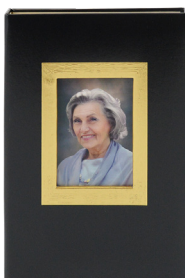
Black Photo Book